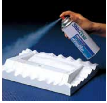
Mold releasing agent for rubber products