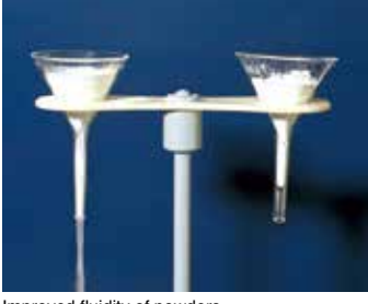
Improved fluidity of powders

For more information, please refer to our technical materials.