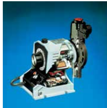
Lubricants for instruments