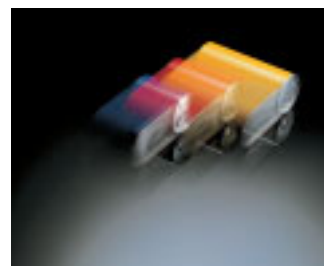
Applications to can paints

Friction coefficient reducers improve the slip properties of the painted surface by lowering the friction coefficient. As a result, they protect painted surfaces from scratches and smudges and allow the paint to appear smooth and attractive for long periods of time. They also prevent beading and improve the multicoat properties. KP306 also reduces the poisoning of platinum catalysts in exhaust gas combustion devices.