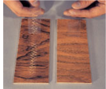
Separation test with cellophane tape on plywood (Left: Without silicone. Right: With silicone.)