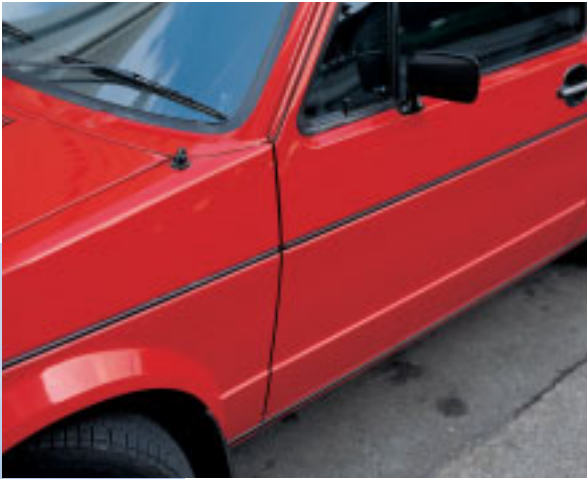
Applied to automotive paints