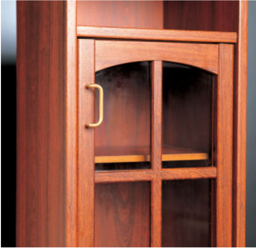
Application to plywood paints