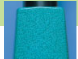
An attractive hammertone pattern

*Hammertone: A tortoiseshell pattern formed by aluminum powder added to the paint.